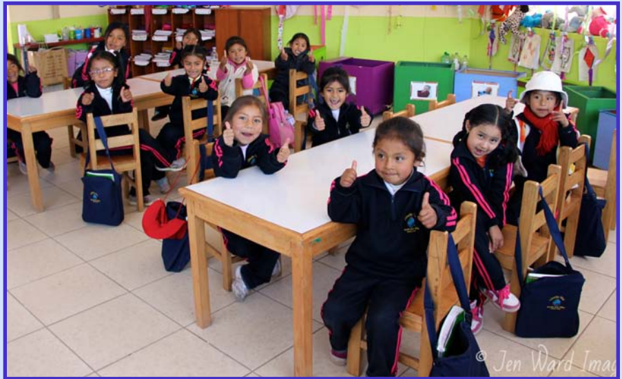
Please meet our 4 year old kindergarten