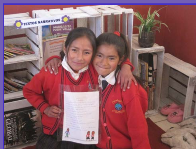
Proud girls sharing book report. Below Quinoa recipe instruction for good nutrition by 5 yr old kindergartener.