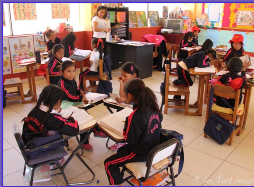
CW students learn anatomy and physiology of the digestive tract. Teachers use group projects to develop problem solving and creative thinking using group resources