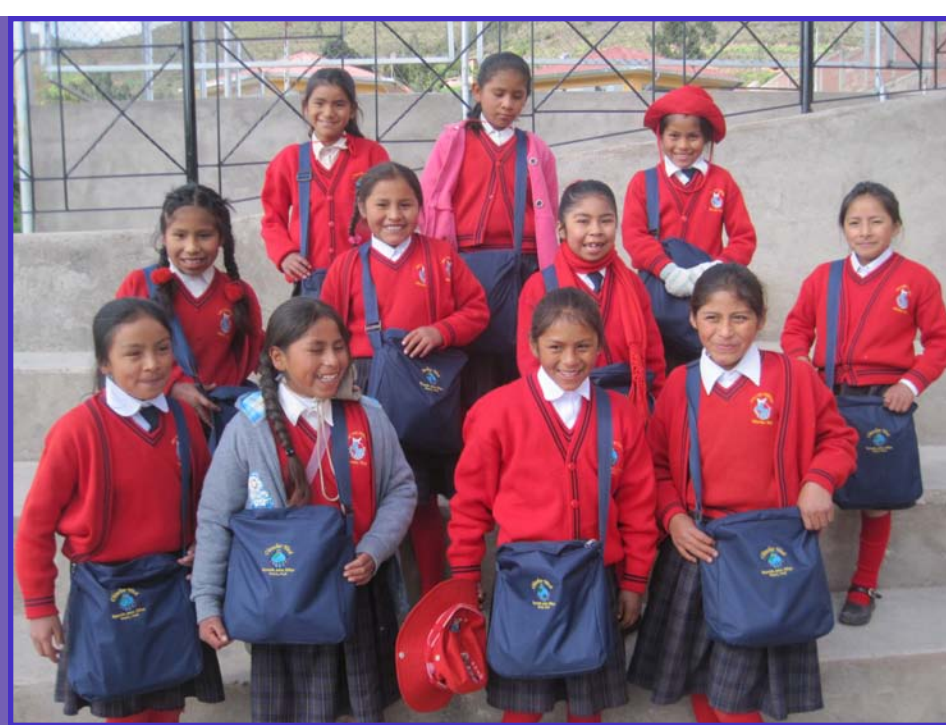
First day of school and girls grades 1-6 are outfitted with new book bags