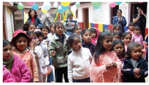
Chicuchas Wasi class of 2008

With the new resources being provided for our new school building, basic operating expenses and supplies, we want the members of our CW Family to know how much we need and appreciate their continuing support. Ongoing donations, large and small, will enable Chicuchas Wasi to acquire necessary materials and special supplies needed to expand the educational services offered now and in our new school.