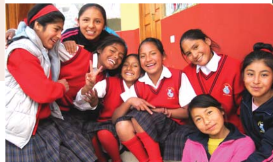
Students from our first 6th grade graduating class (click image for more photos of our 6th grade students)